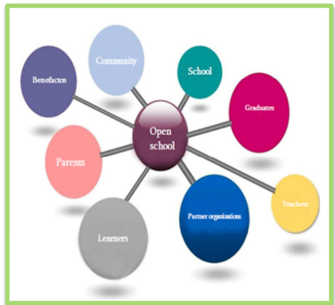
Figure 1. Structure of Open School.

The school organizes the effective collaboration of these components with its supervisor and teaching staff. The school becomes an example of an organization whose activities are open to the community and society is shown in Figure 1.